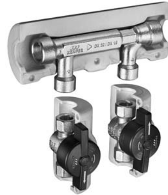
640 06 KHS-Venturi Distributor Group for surface mounting with female thread