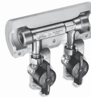
640 05 KHS-Venturi Multi-Circ Distributor Unit for surface mounting with MT / coupling nut