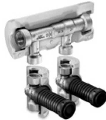
660 00 Dyn. Flow Distributor Group for Geberit inliner system, for concealed installation