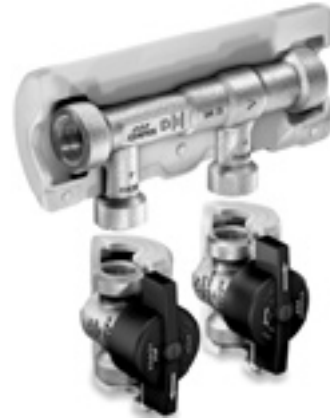
660 06 Dynamic Flow Distributor Group for Geberit inliner system, for surface mounting

Fluid-contacting parts made completely of gunmetal Temperature maintenance in the WDW system through integrated cartridge and inliner piping system Maximum flow isolating ball valve DIN-/DVGW approved according to DIN EN 13828, W 570 Maximum flow isolating ball valve with removable 'Top Entry' inner head part Soundproofing tested in accordance with DIN EN ISO 3822, Class 1 Pressure stage PN 16 Insulating shell building material class B1 compliant with DIN 4102 Stagnant-zone-free